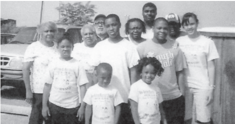
YOUTH MINISTRY CLEANS UP TRADE STREET