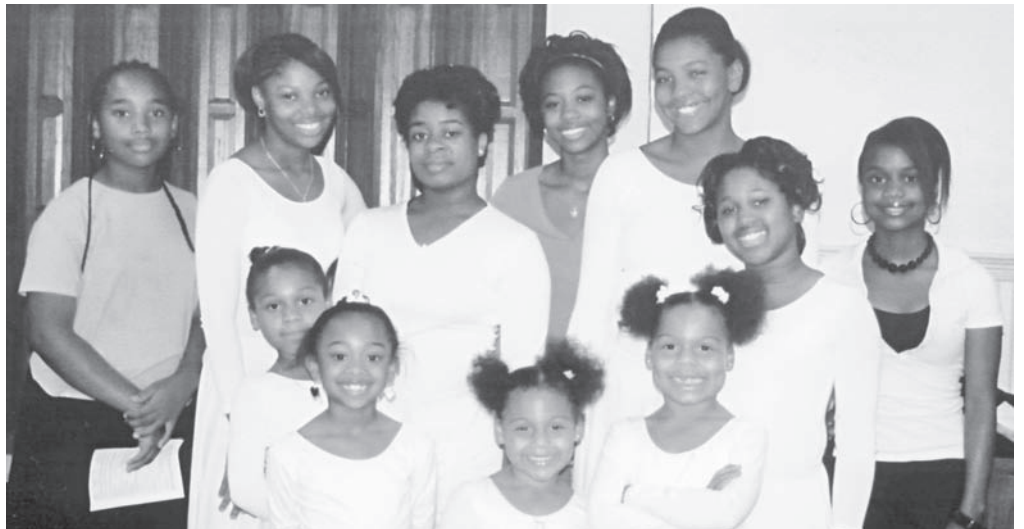
NEW BETHEL BAPTIST CHURCH LITURGICAL DANCERS