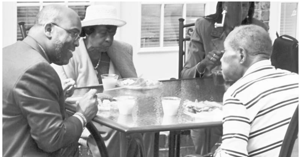
PASTOR AND PASTOR EMERITUS ENJOY BRUNCH

(Continued Page 4, Columns 1 & 2, Article 2)