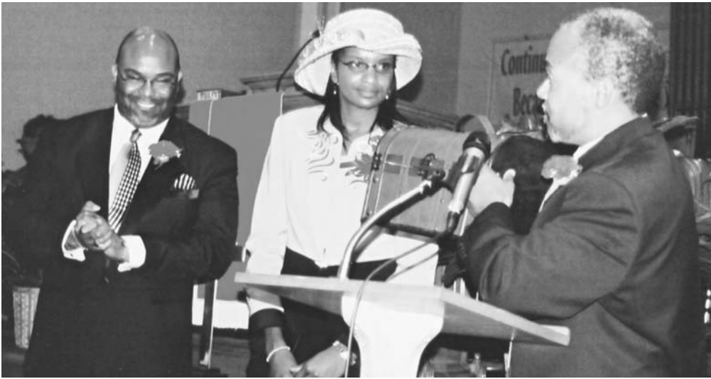
THE JONESES RECEIVE GIFTS AT INSTALLATION SERVICE