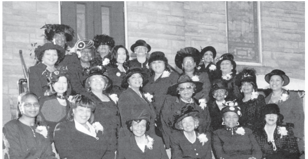
THE EFFORT CLUB TO OBSERVE ANNIVERSARY AND RACE PROGRESS PROMOTERS PROGRAM