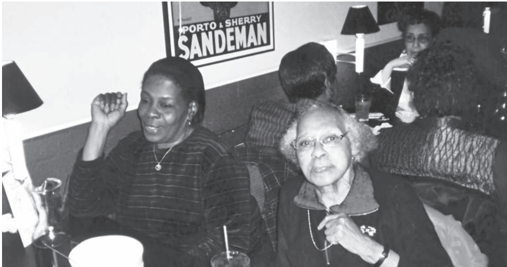
SENIOR MINISTRY GROUP ENJOYS OUTING TO THE BARN DINNER THEATER