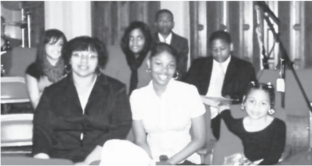
HONOR ROLL STUDENTS FOR SECOND QUARTER