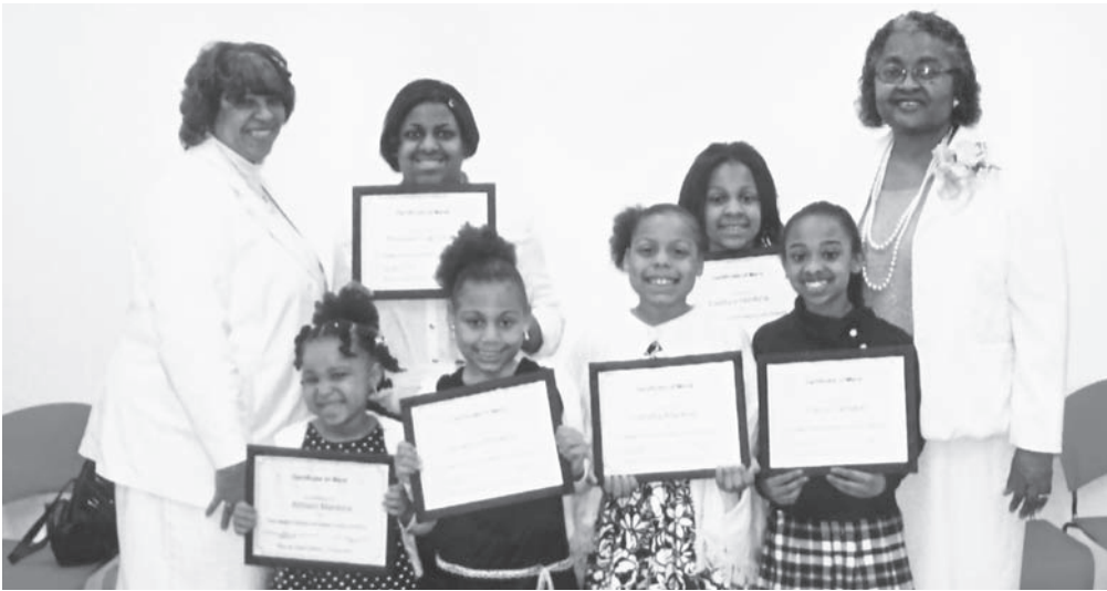
YOUTH BECOME JUNIOR ACHIEVERS