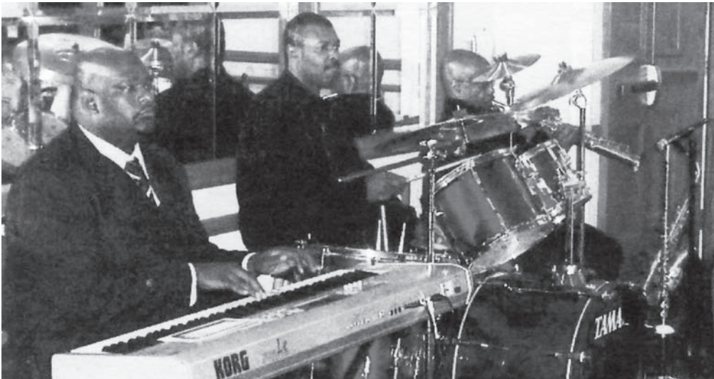
NEW BETHEL ANNIVERSARY TRIO