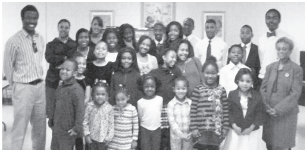
CHILDREN'S CHURCH MEMBERS AND VOLUNTEERS CELEBRATE 4TH ANNIVERSARY