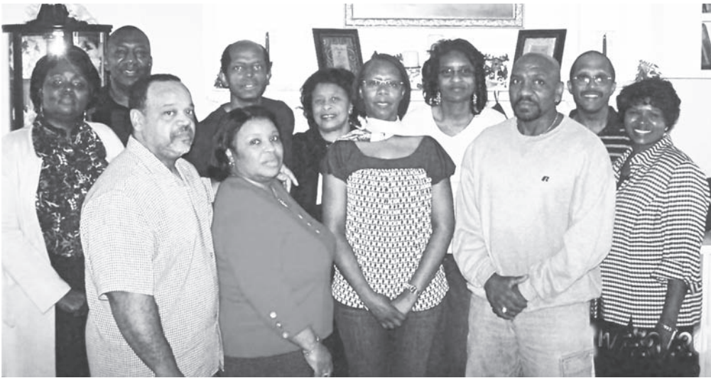
INTERCESSORS PRAYER COTTAGE