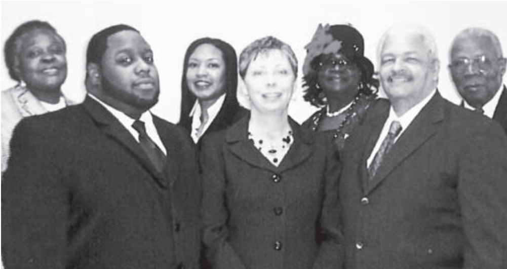
NEW BETHEL'S ASSISTANT MINISTERS