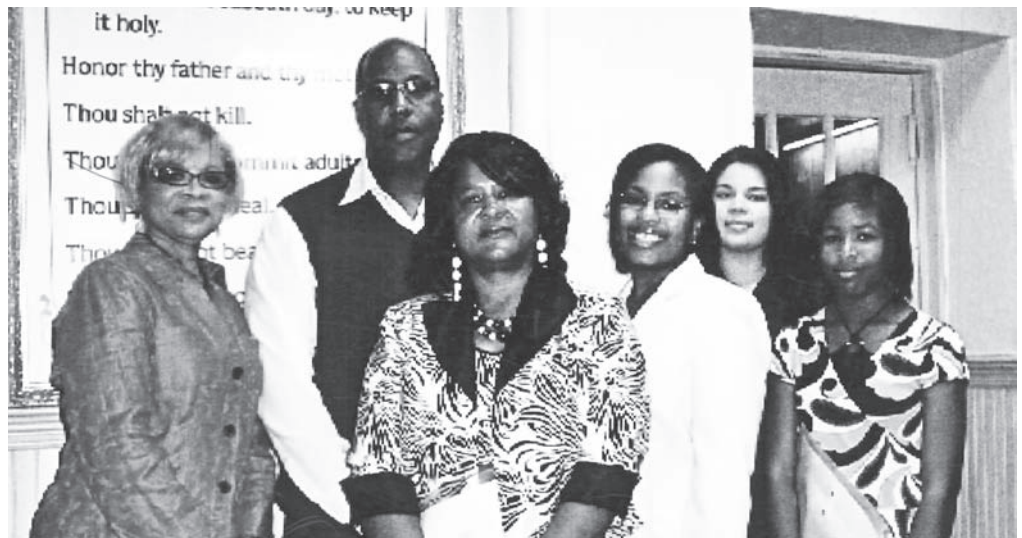
NEW MEMBERS OF NEW BETHEL