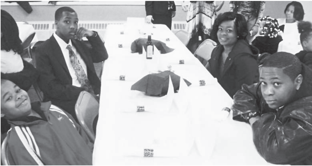
YOUTH MINISTRY MEMBERS ENJOY DINNER/DANCE