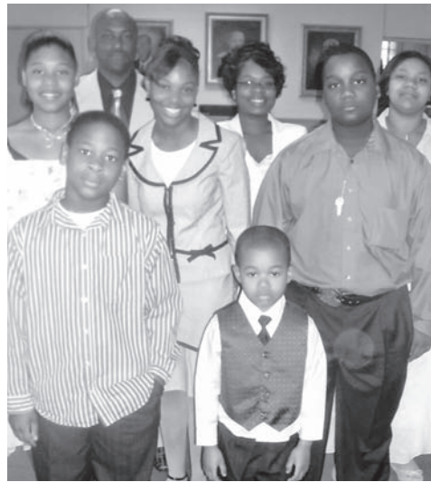
NEW BETHEL STEP TEAM

My loss was made easier, also, knowing that my brother and sister were both saved and had accepted Christ as their personal savior. If we plan to see our loved ones again, we must stress to our family members a new life in Christ. With Easter arriving next Sunday, please share the resurrection story with all of your loved ones. Be sure that they all have accepted Christ as their personal Savior. Remember the scriptures tell us "he that believeth in Christ shall never die!"