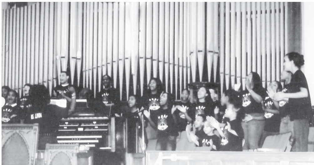
NEW BETHEL YOUTH CHOIR

The anniversary provided a spiritual uplift to a Youth/Young Adult Weekend at New Bethel.