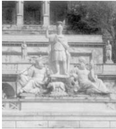
THE EIFEL TOWER / THE STATUE NEAR PIZZA DEL POPOLO